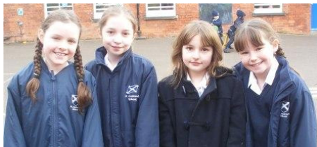
Year 4 Team

The Junior School Swimming teams beat Bedford Girls' School at their Swimming Gala on 10 February. All three age groups won, with an overall St Andrew's score of 115 points to Bedford Girls' School's 89 points.