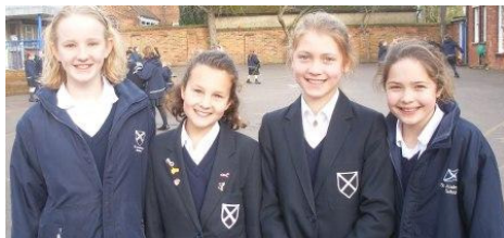
Year 6 Team

The Junior School Swimming teams beat Bedford Girls' School at their Swimming Gala on 10 February. All three age groups won, with an overall St Andrew's score of 115 points to Bedford Girls' School's 89 points.