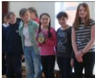
Junior Winners—Year 6 Stuart