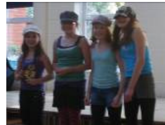
Senior Winners—Year 7 Tudor